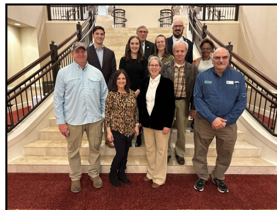
District staff, commissioners and the NRCS district manager attend the Conference in Spartanburg.