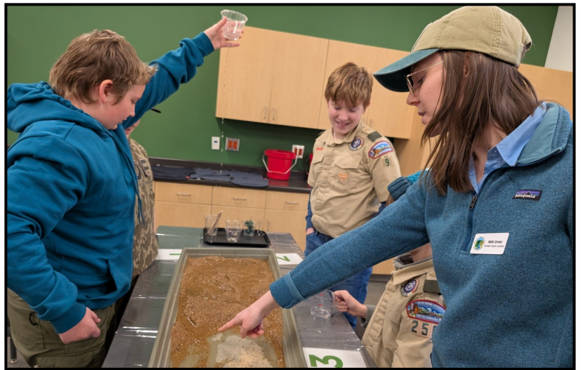
Scouts used erosion prevention structures to stabilize a miniature neighborhood landscape in an erosion simulation activity.