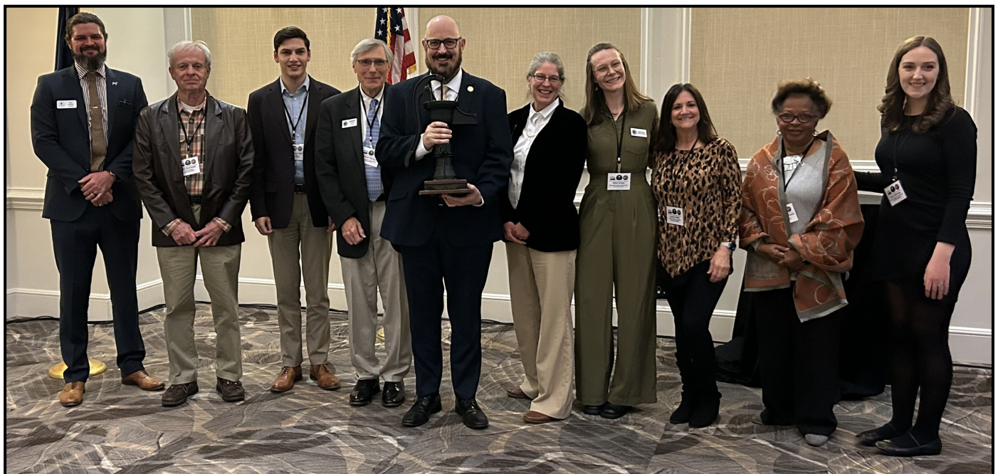
Staff and commissioners