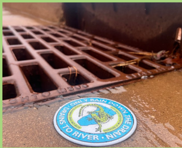
Storm drain marker in the rain.